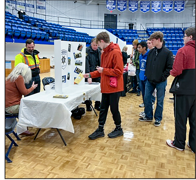
TCHS students checking out the Career Fair organized by the school last week.